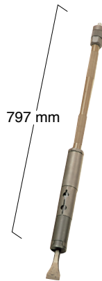
Model S-500 Non-CE