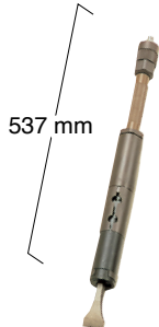
Model S-250 Non-CE