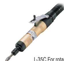
L-35C For rotary burrs