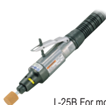
L-25B For mounted wheels